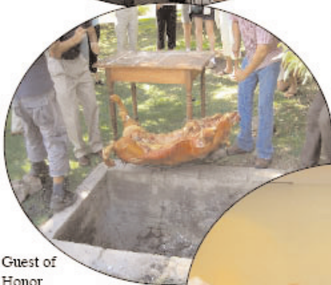
Guest of Honor