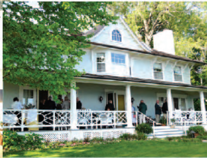
'55 Chez Musser