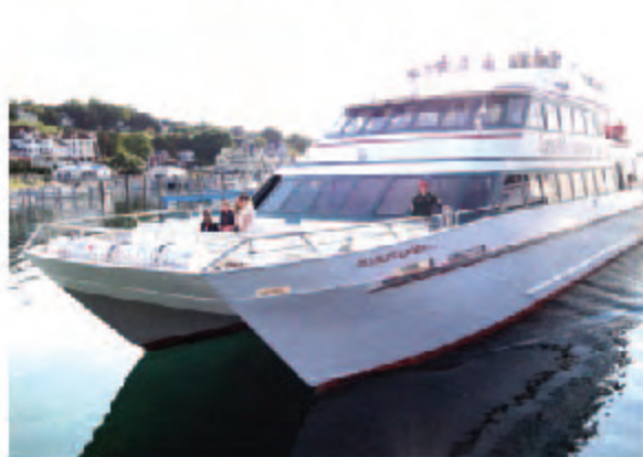
A taxi to the mainland

Next: Homecoming and Mini-Reunion Oct. 21-23