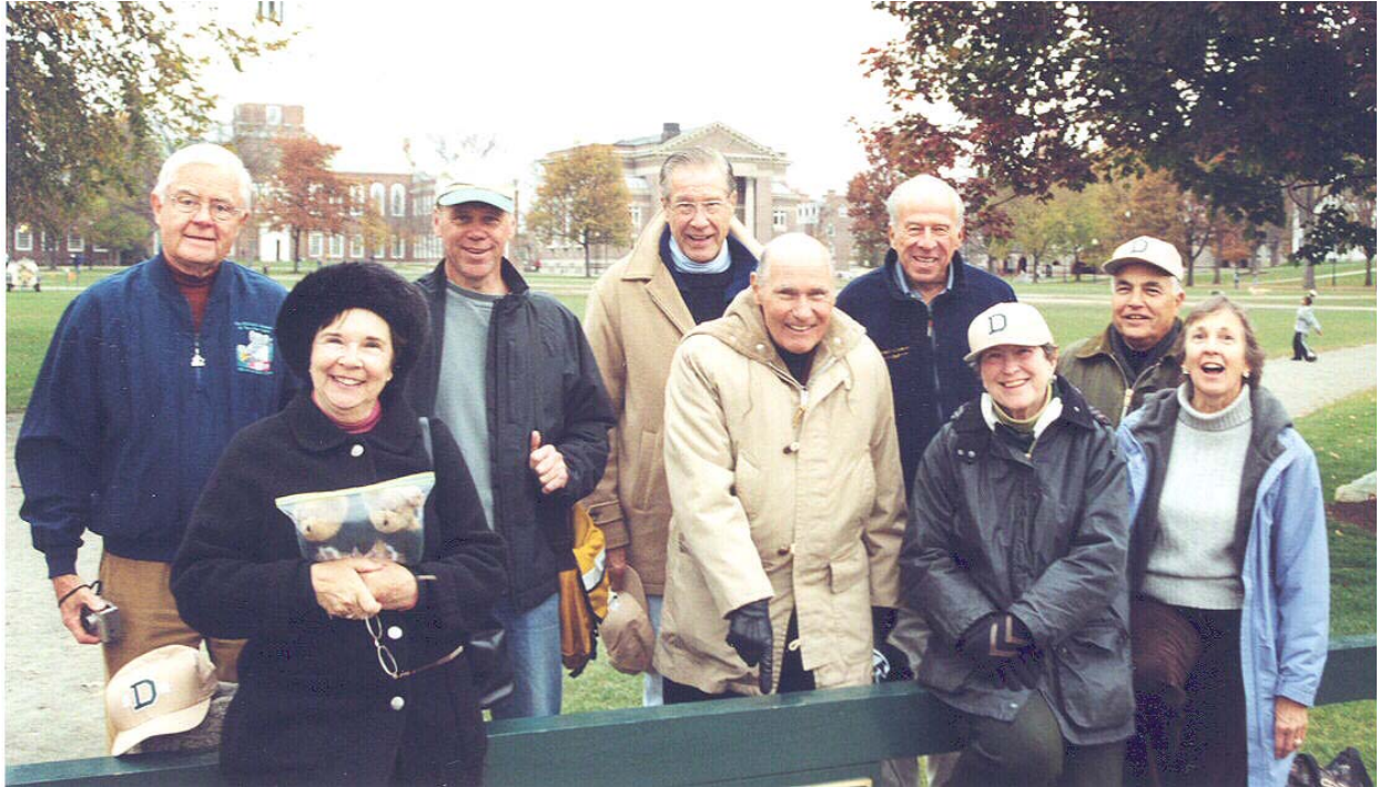
The Senior Fence was relocated thanks to a gift from the Great Class of 1956, and here are some recent '56 fence sitters, spouses, and friends enjoying the new location.