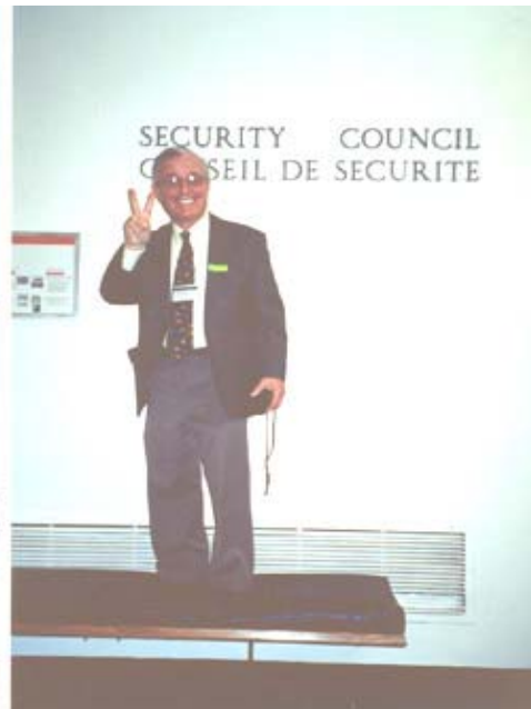
^ Which one is taller? ^