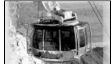
Rotating Aerial Tramway

shopping on El Paseo drive or at the Cabazon outlet stores. Or, maybe you would like a hike in the desert, which will be led by Duane Cox. Or perhaps your thing is a ride on the 360-degree rotating tram to the top of the mountains where you may still see some snow in April. On Friday evening, a class dinner at Les Vallauris, a top Palm Springs restaurant.