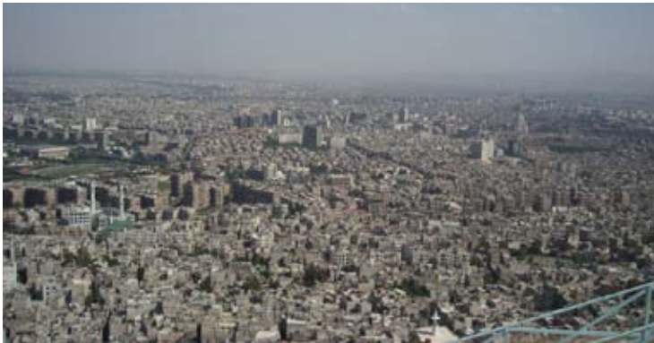
The sprawling city of Damascus

Last week we took two field trips with the students, which was really good for me as it gave me the opportunity to have more in depth conversations with the students and I also got to see more of Syria. The first trip was to Deir Mar Musa, which is perhaps the first monastery ever built. It's built in the mountains overlooking the desert, and is unlike any place I've ever seen. The second was to Bosra, the ruins of an ancient Roman city. The most spectacular part was the theatre which is in really fantastic condition.