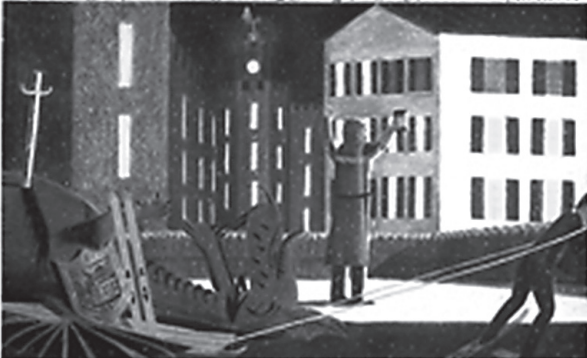
Dartmouth Winter Carnival - February 6-9, 1997

DO YOU REMEMBER THESE WINTER CARNIVAL POSTERS FROM OUR TIME AT DARTMOUTH? THIS YEAR'S WINTER CARNIVAL RUNS FROM FEBRUARY 9TH-12TH.