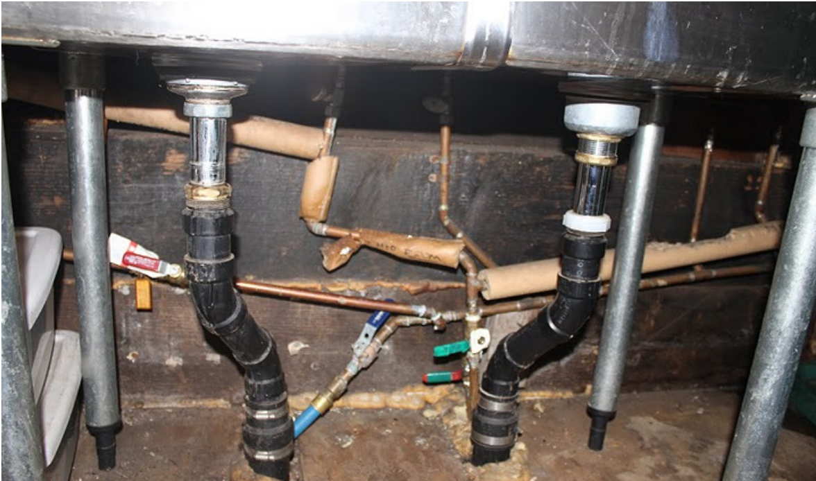
View of final valve positions for water system to be operational in summer and after turning ON in Winter