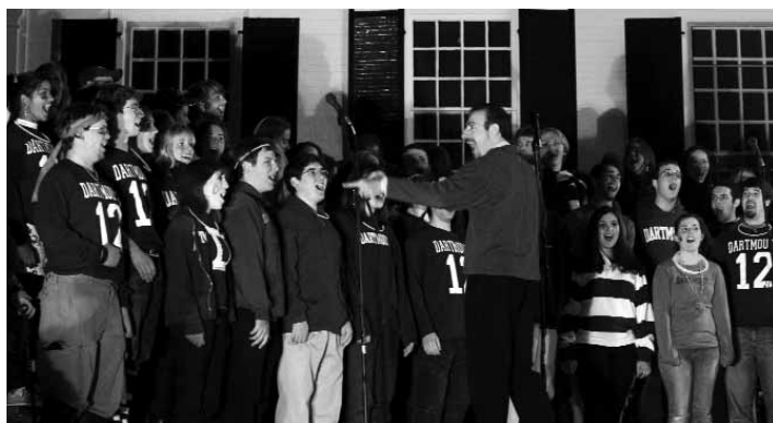
The Dartmouth College Glee Club

The Dartmouth College Glee Club will be stopping in New York City as part of its annual spring tour in March.